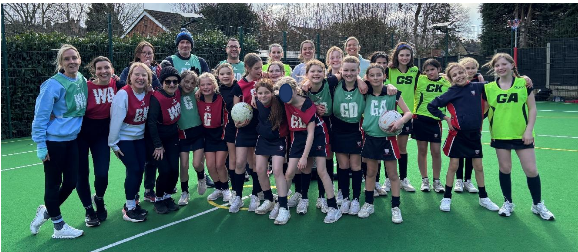
Form VI and Staff joined for a fun afternoon of Netball combat, with Lanc emerging victorious.