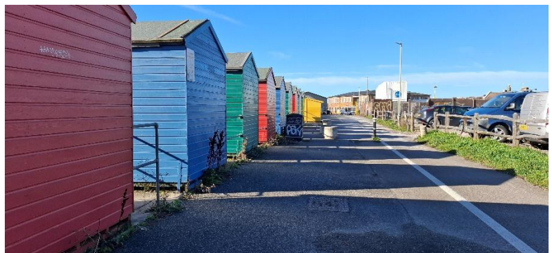
Grace Sayers, Form IV, Beach Huts.